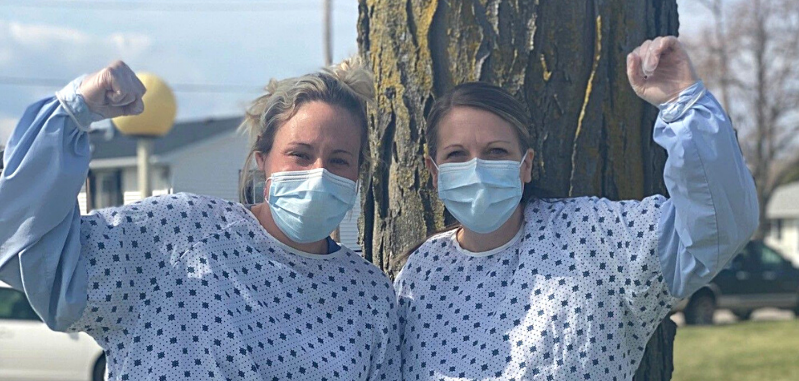
Caregivers at Emerald Nursing Facility in Cozad.