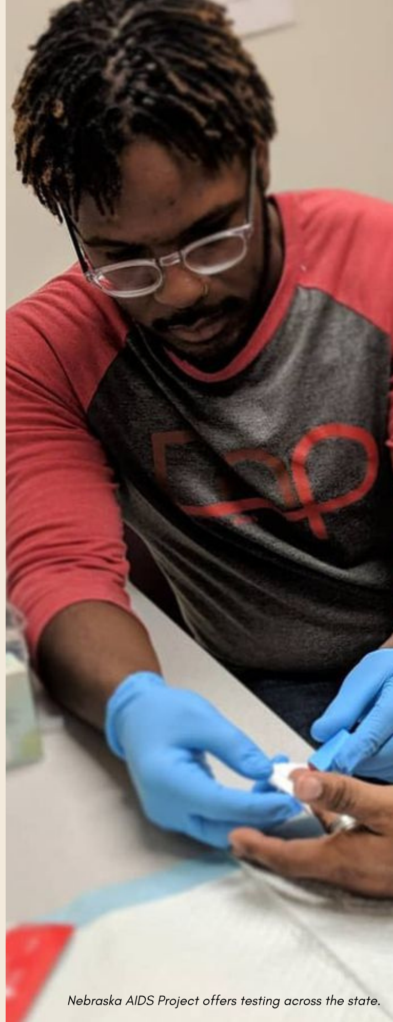
Nebraska AIDS Project offers testing across the state.

Agencies offer support tailored to the needs of the people they serve. All CHAD agencies provide vital support.