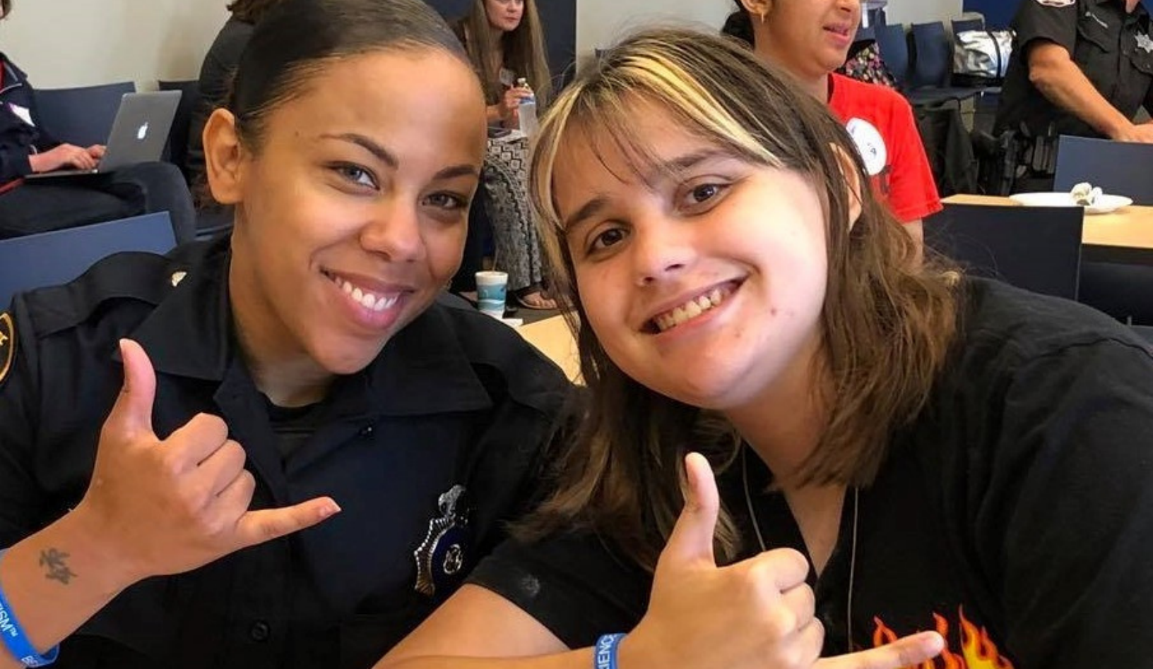
Participants at the national Be Safe training event, hosted by Autism Action Partnership.